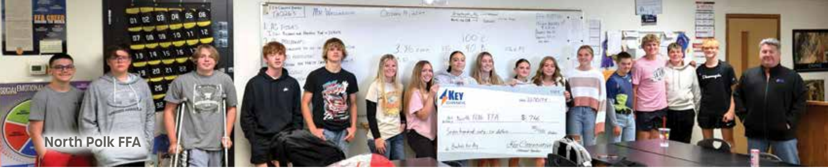
North Polk FFA