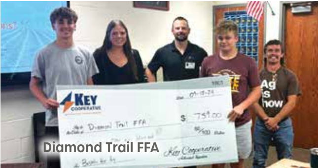
Diamond Trail FFA